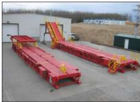
North Rig's production facility in Alberta, Canada

NORTH RIG CATWALK TECHNOLOGIES LTD. Box 1396 244 River Avenue Cochrane, AB T4C 1B4 CANADA